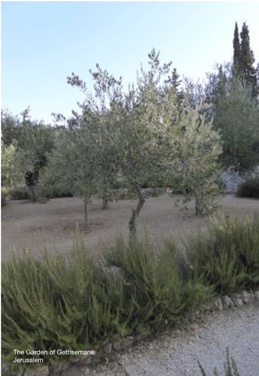
The Garden of Gethsemane Jerusalem