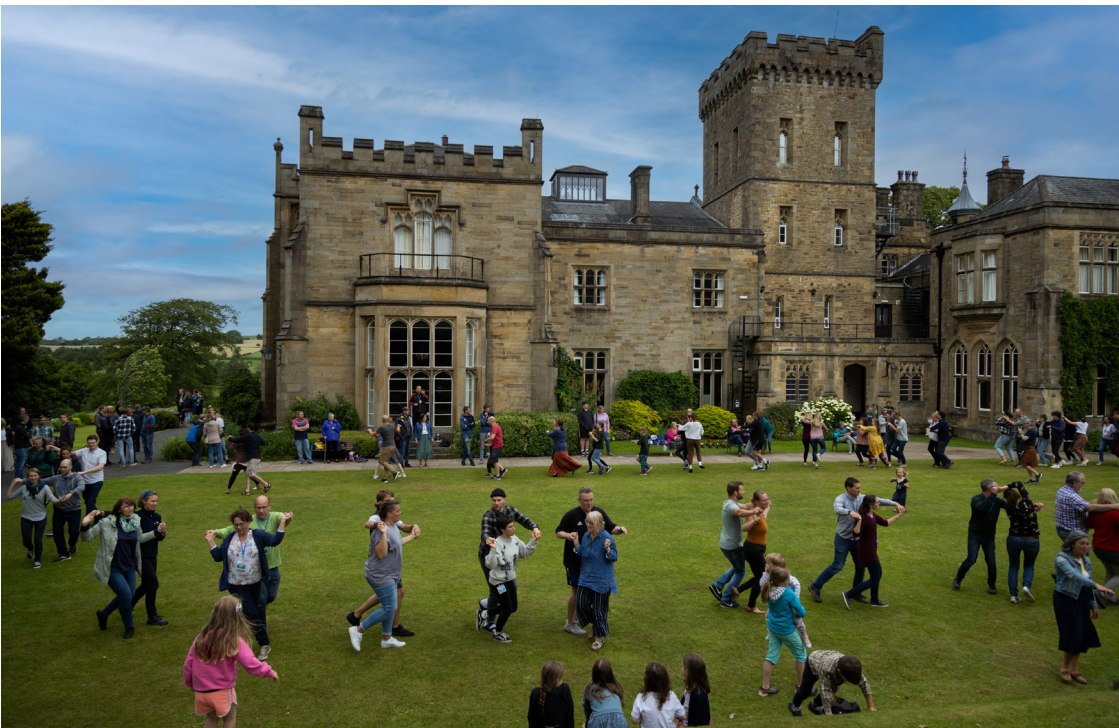
Ceilidh on the Croquet Lawn, June 2022

today as when it was first set up, working to ensure young people have firm foundations in Christ. Our hearts' desire is to see Capernwray remain open for many years to come, for this generation and for future generations, with the Hall filled with Bible School students and holiday guests.